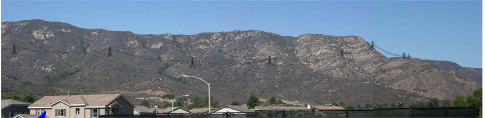
Above: Simulation of Talega-Escondido/Valley-Serrano Interconnect, Staff Alternative, as would be seen from a park on Palomar Road, just North of Wildomar's Corydon Road boundary. Road scars are not shown.