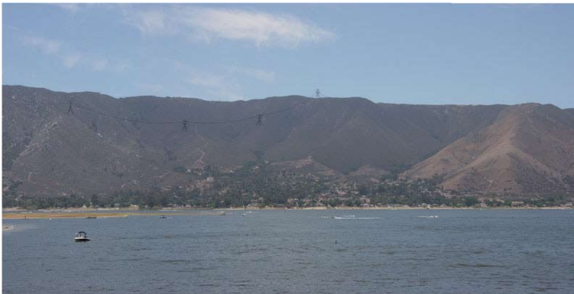
Left: Simulation of Talega-Escondido/Valley-Serrano Interconnect, Staff Alternative, as would be seen 200 yards south of the city boat ramp. Road scars are not shown but they would be comparable to existing road scar just left of center.